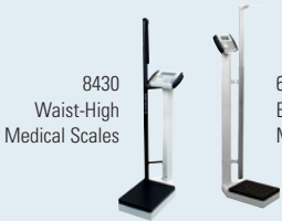
8430 Waist-High Medical Scales