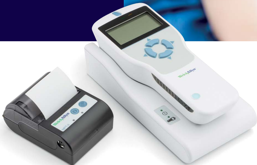
Welch Allyn MicroTymp 4 Portable Tympanometer